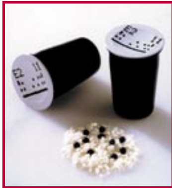
Actual Test Cup size is approximately 2cm x 1cm.